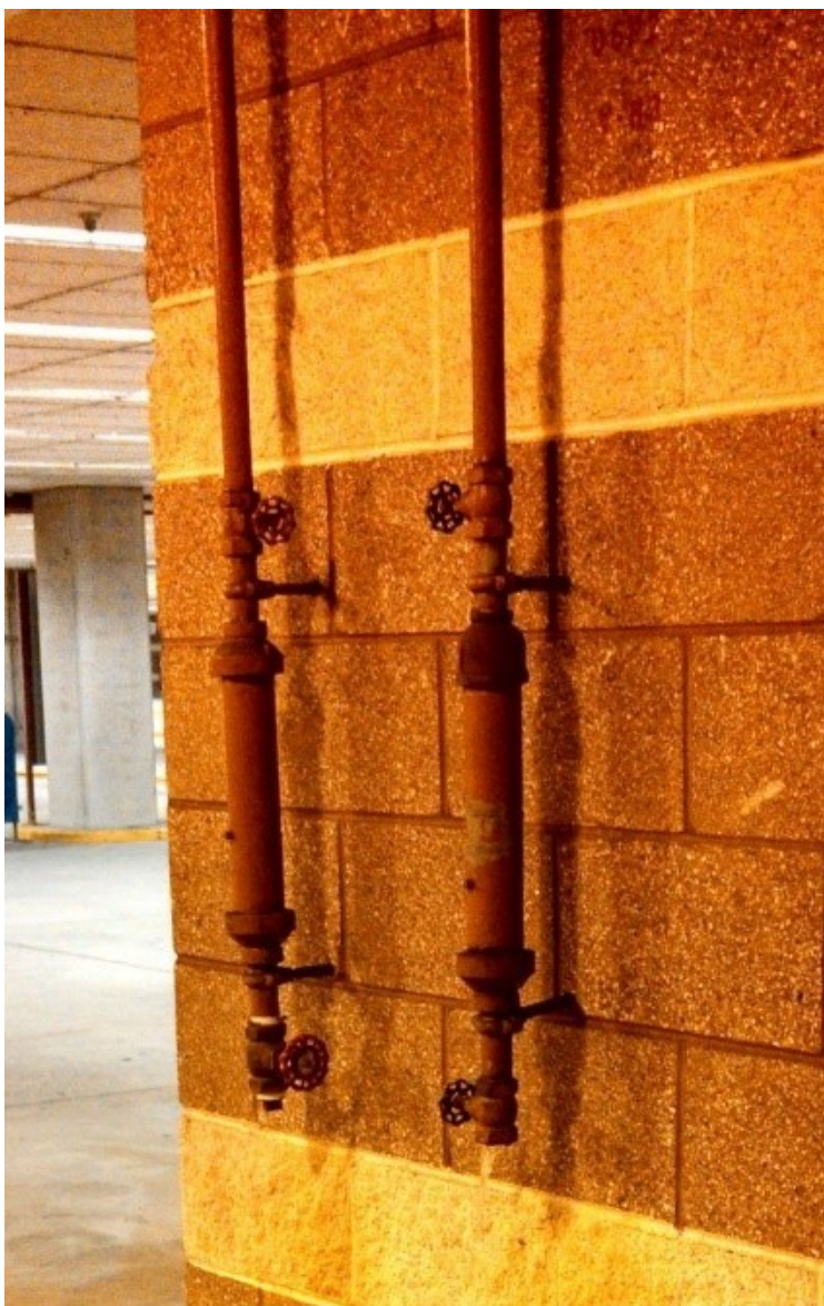
Example Drum Drips (Auxiliary Drains) in a Parking Garage.

16.10.5.3.6 Tie-in drains shall be provided for multiple adjacent trapped branch pipes and shall be only 1 in. (25 mm). Tie-in drain lines shall be pitched a minimum of 1/2 in. per 10 ft (4 mm/m).